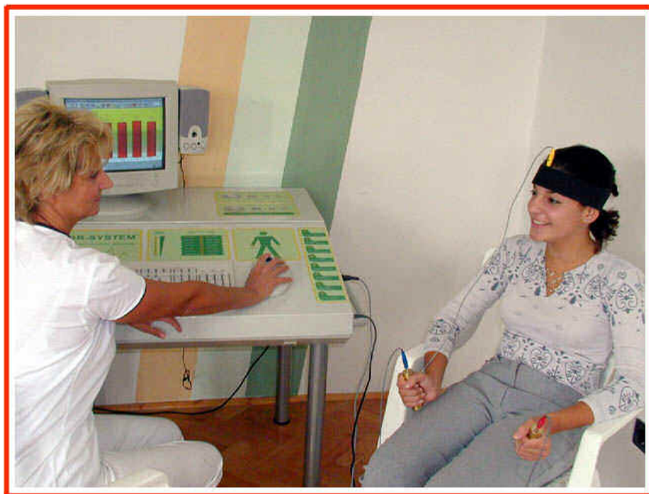
Controlling of bioelectric balance by IBR - SYSTEM ®